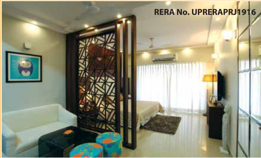
RERA No. UPRERAPRJ1916