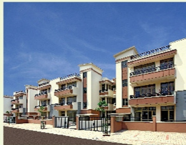
Eldeco County Sector 19, Main G.T. Road, Sonapat