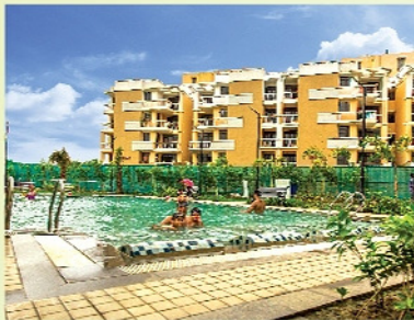
Eldeco Mystic Greens Sector Omicron, Greater Noida