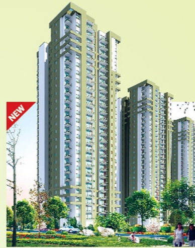
Eldeco Inspire Sector 119, Noida