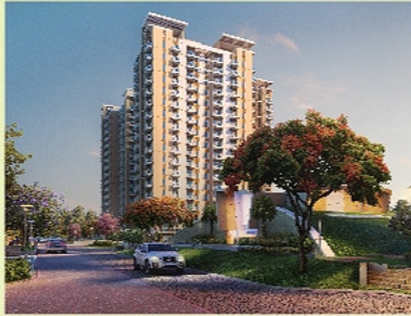
Eldeco Accolade Sector 2, Sohna Road, Gurgaon