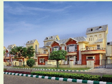
Eldeco Estate One, Panipat Sector 40, G.T. Karnal Road