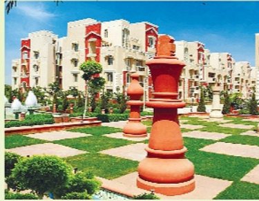
Eldeco Edge Sector 119, Noida