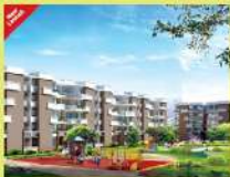
Eldeco Mystic Greens Sector Omicron, Greater Noida