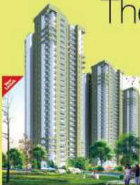
Eldeco Magnolia Park Sector 119, Noida