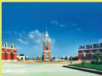
Eldeco Estate One Sec. 40, G.T. Karnal Road, Panipat