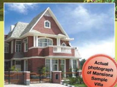
Actual photograph of Mansionz Sample Villa