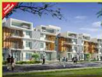
Eldeco Greens Nakodar Road, Jalandhar

The Eldeco Group has been at the forefront of Real Estate development in North India since 1975. The group is synonymous with timely and quality delivery in a number of cities like Lucknow, Kanpur, Agra and NCR of Delhi. With carrying 30 years of expertise in construction and real estate development, Eldeco has delivered more than 175 projects spanning townships, hi-rise condominiums, townhouses, malls and office complexes. In addition, 30 projects are in various stages of active execution. The aggregate constructed area stands at more than 20 million sq. ft. with more than 15000 satisfied customers. Currently apart from the towns mentioned above, Eldeco is developing integrated townships in Panipat, Sonapat, Ludhiana, Jhansi and Jalandhar. Eldeco's transparent and principle driven business philosophy has been widely recognised. The group's business activities rest on the principle of high quality, superior construction technology and high consumer satisfaction. Eldeco stands firm in its commitment to 'creating value and cementing trust' and is heading towards ever-greater success.