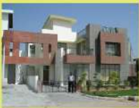
Eldeco County Sector 19, Main G.T. Road, Sonapat