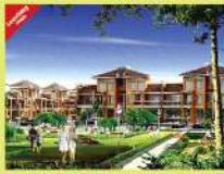
Eldeco Eden Park Japanese Zone, Neemrana