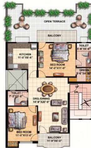
SECOND FLOOR PLAN - 2 B/R + 2T + Dress Super Area - 1165 sq ft + Terrace area

Disclaimer: • The area and plan shown here are indicative. • 1 sq. ft.=0.093 sq. mt. 10.764 sq. ft.=1.196 sq. yd. and 3.28 ft.= 1 mt. • All dimensions shown in feet inches are close approximation to metric dimensions. • The dimensions and super area mentioned above may vary from unit to unit. • Please check exact dimensions with the marketing team.