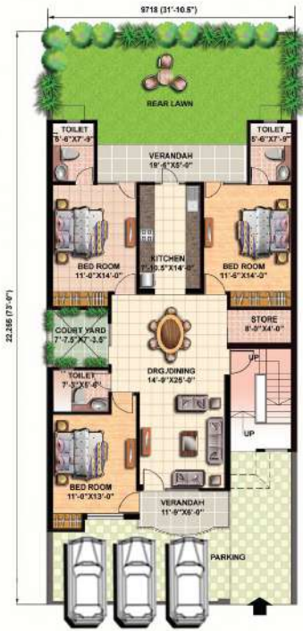
GROUND FLOOR PLAN - 3 B/R + 3T + Store + Lawn Super Area - 1565 sq ft + Lawn area