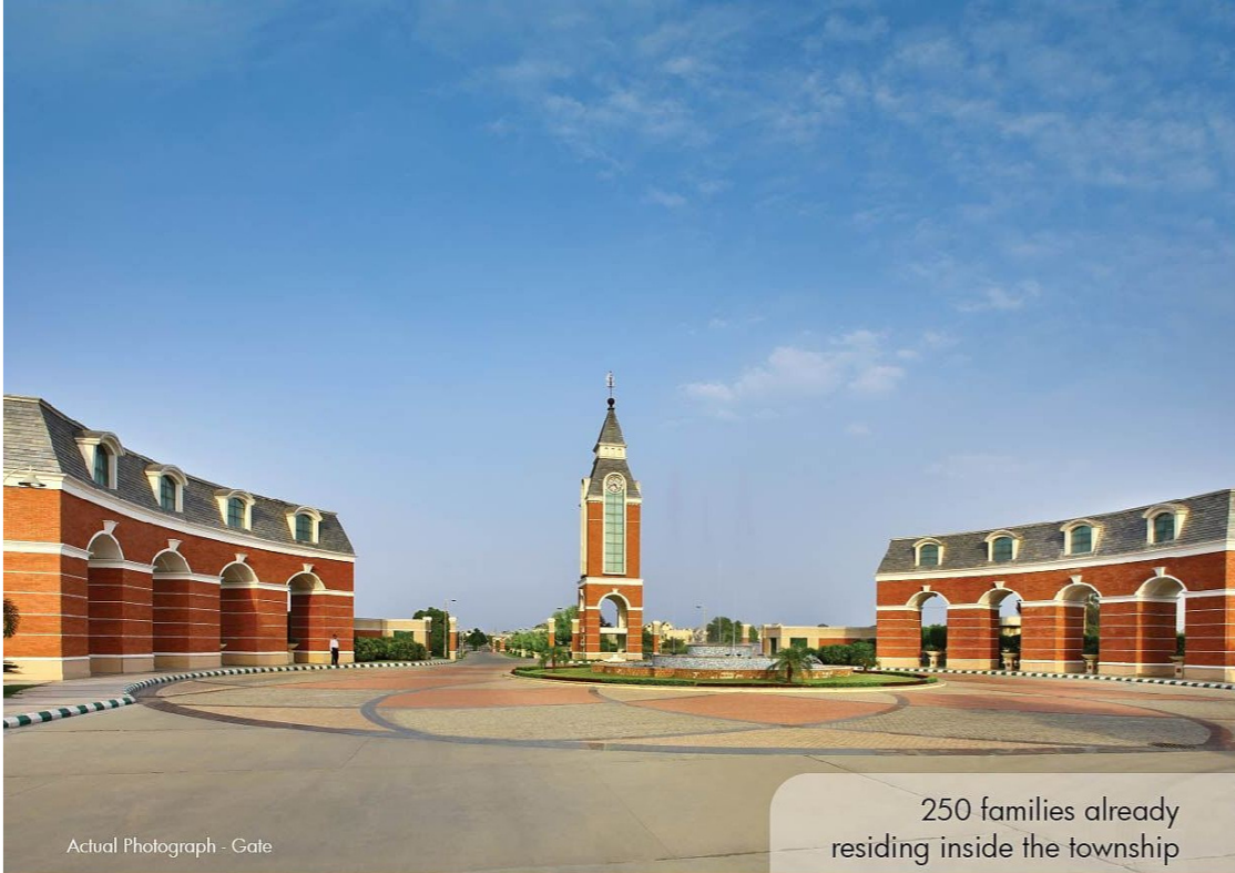
Actual Photograph - Gate

250 families already residing inside the township