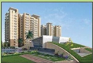
Eldeco Accolade Sohna Road, Greater Gurgaon