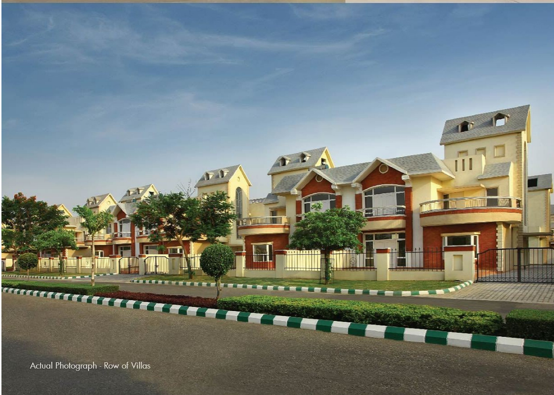
Actual Photograph - Row of Villas

More than 1000 residential units are at various stages of completion