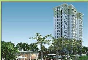
Eldeco Edge Sector 119, Noida