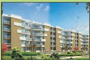
Eldeco Mystic Greens Sector Omicron, Greater Noida