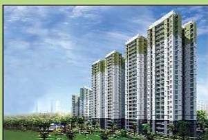
Eldeco Inspire Sector 119, Noida