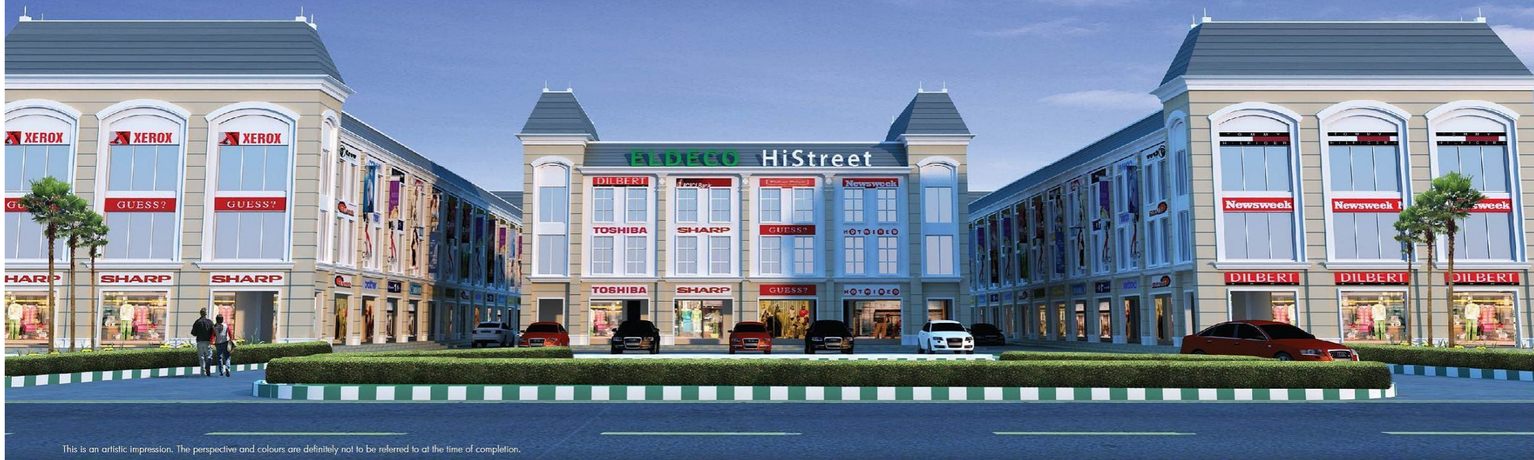
This is an artistic impression. The perspective and colours are definitely not to be referred to at the time of completion.

Eldeco presents Eldeco Hi Street, a well-planned retail space inside Eldeco Estate One, right on the main entry of the township. With a huge captive market of over 1000 families will be residing at Eldeco Estate one another 2000 families in its near vicinity, Eldeco Hi Street presents excellent investment opportunities with decent anticipated rental returns.