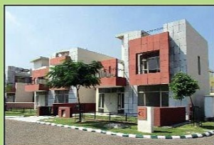
Eldeco County Sector 19, G.T. Karnal Road, Sonapat

Eldeco Group has been at the forefront of Real Estate development in North India since 1975. The Group is synonymous with timely and quality delivery in a number of cities like Lucknow, Kanpur, Agra, Noida, Greater Noida and other parts of Delhi/NCR. Carrying more than 35 years of expertise in construction and real estate development, Eldeco has delivered more than 200 projects spanning townships, high-rise condominiums, industrial estates, malls and office complexes. In addition, 30 projects are in various stages of active execution. The aggregate delivered area stands at more than 40 million sq.ft. with more than 25000 satisfied customers. Currently, apart from the towns mentioned above, Eldeco is developing projects in Panipat, Sonapat, Ludhiana, Jhansi, Neemrana and Jalandhar. The unique 1200 acres state-of-the-art Eldeco Sidcul Industrial Park at Sitarganj, Uttarakhand, is Eldeco's flagship project in the industrial sector.