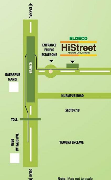
Note: Map not to scale