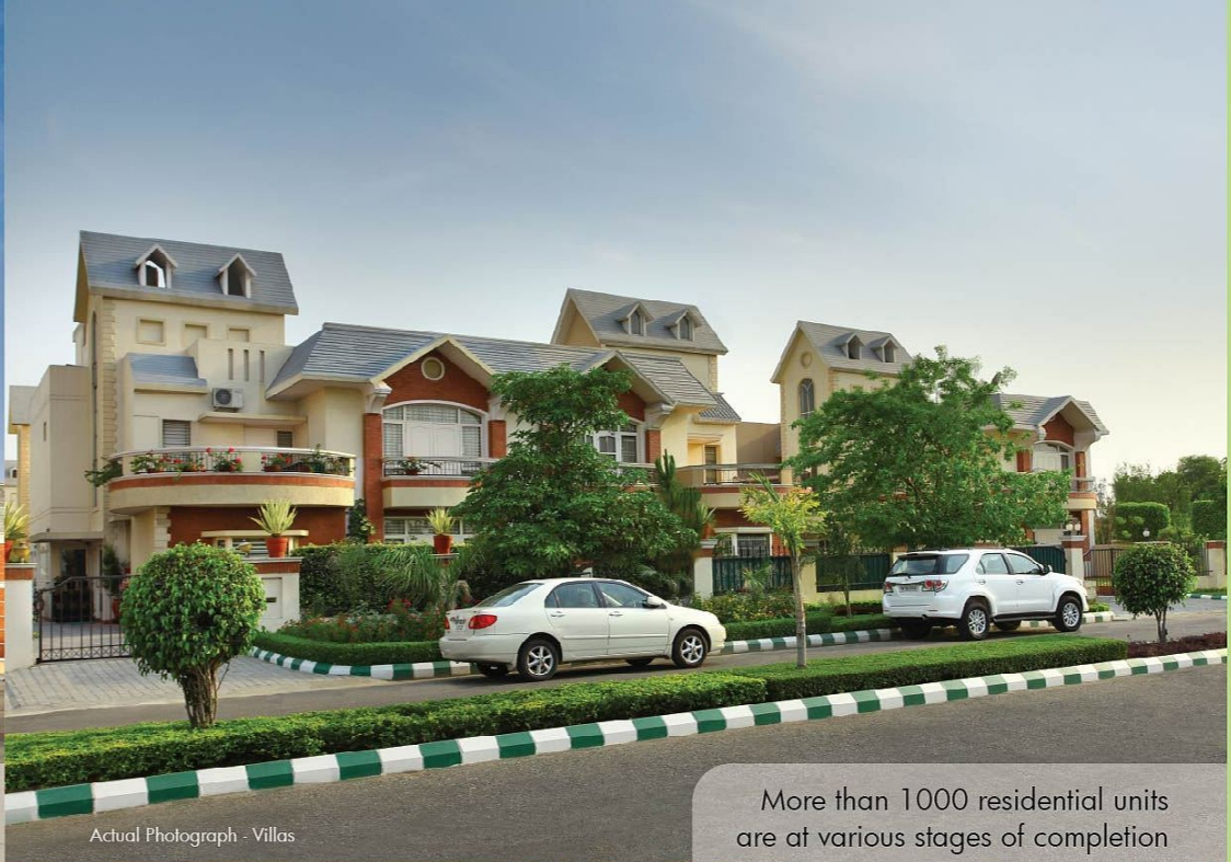
Actual Photograph - Villas

250 families already residing inside the township