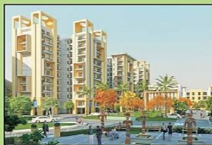
Eldeco Hillside Japanese Zone, Neemrana