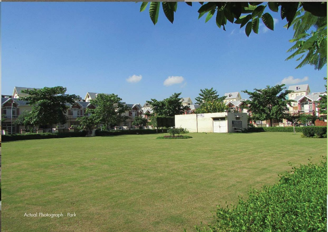
Actual Photograph - Park