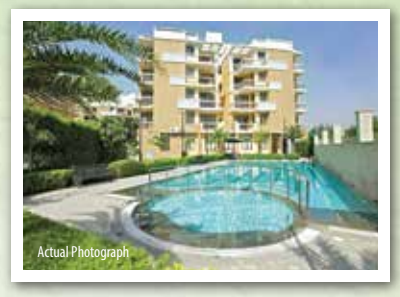
Eldeco Mystic Greens