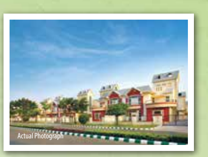
Eldeco Estate One