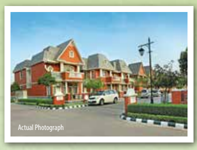
Eldeco Estate One